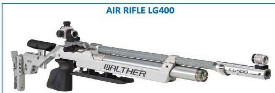
AIR RIFLE LG400